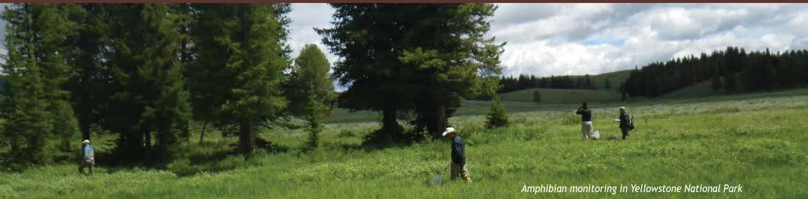
Amphibian monitoring in Yellowstone National Park