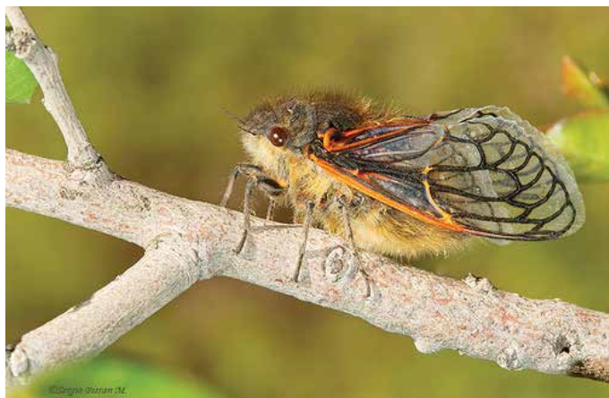
Figure 1. Cicada species Tettigades auropilosa.